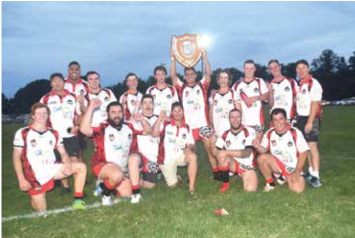
The Bowlie Bears 2018 Roddy Shield Pub Nines premiers.