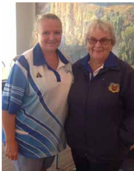
Incoming WBC President with outgoing WBC President & WBC 2018 Club Singles Champion