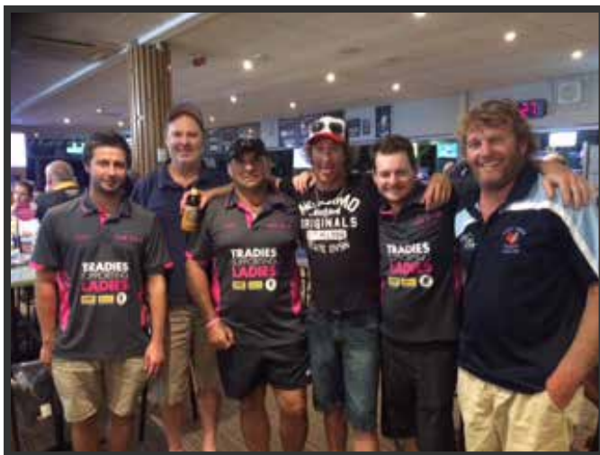
2017 Charity Challenge Bowls finalist More Grass winners over the Rock Chuckers

Money raised in support of Tumut Netball and the Tumut Hospital Auxiliary